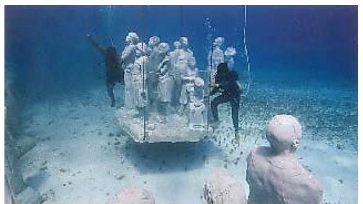
Plate 10: Jason deCaires Taylor and assistants

lowering one of his sculptures to the ocean floor