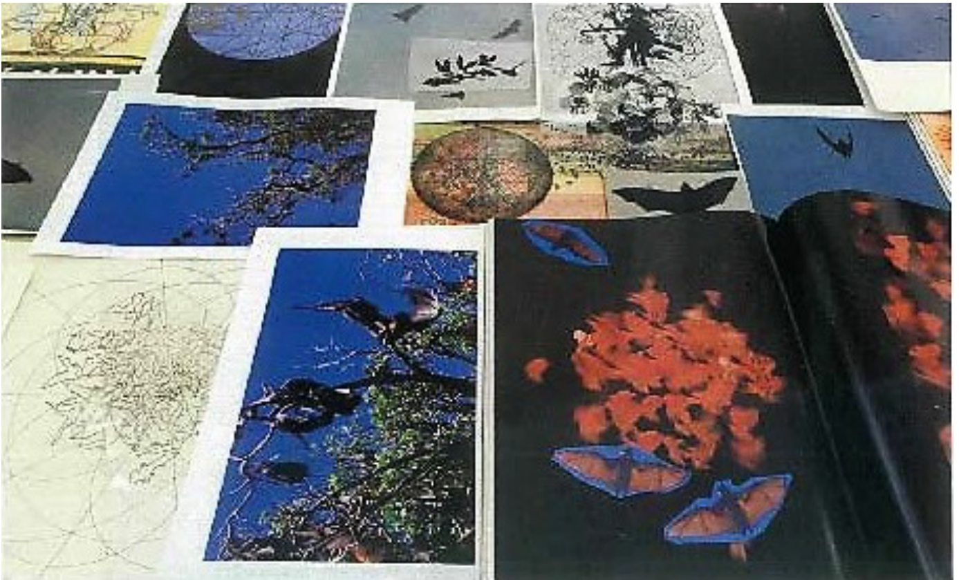
Plate 2: A selection of Sikander's preliminary drawings, photographs and reference material.

Shahzia Sikander carries a camera with her daily, documenting her observations which are frequently incorporated into her work in some shape or form.