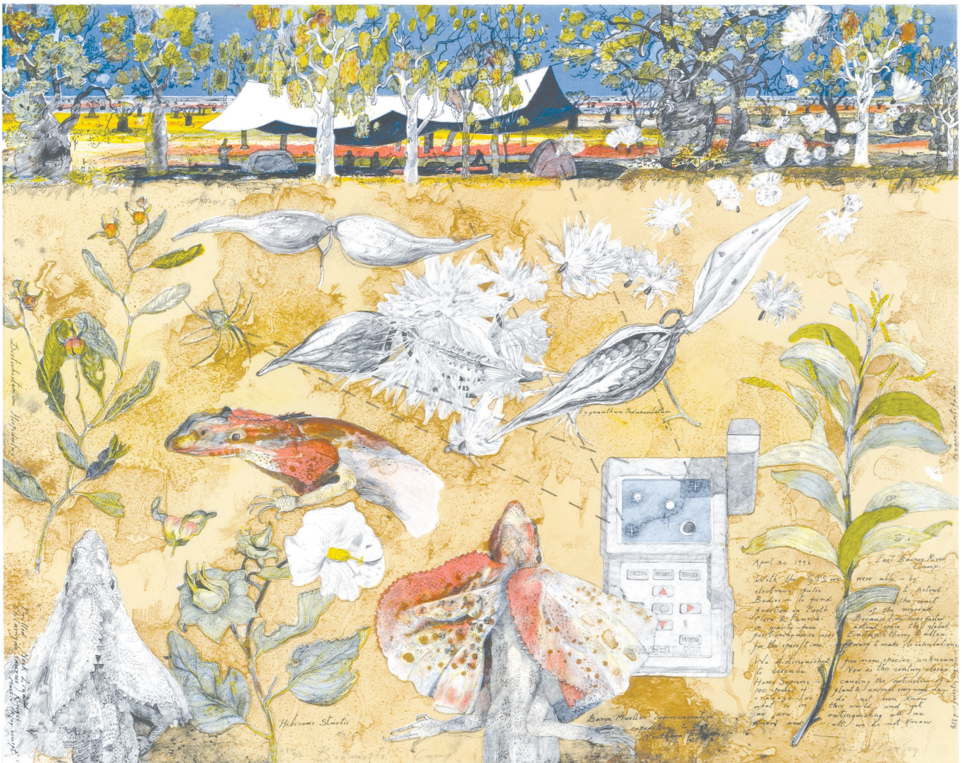
Plate 1: John Wolseley, b. 1938, England Botanist's Camp, 1997 Lithographic print 74x 93.5 cm