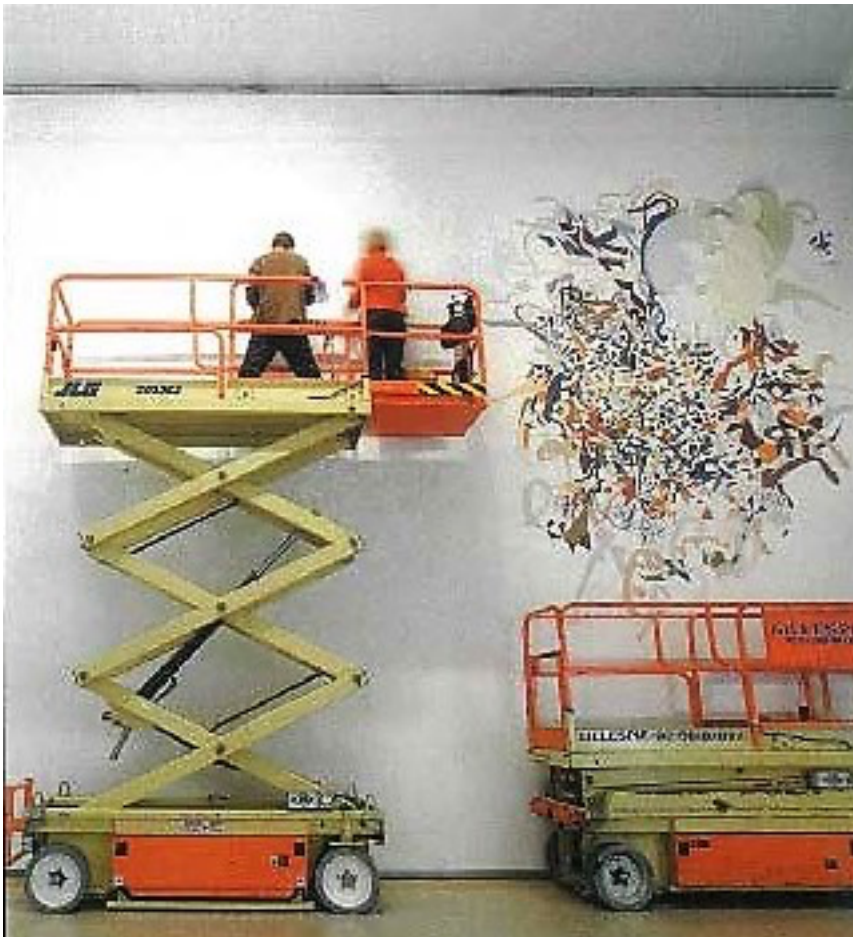
Plate 3: Gallery technicians assisting with the preparation of Sikander's artwork Transformation as Narrative , 2007 for exhibition in the Museum of Contemporary Art, Sydney

Shahzia Sikander carries a camera with her daily, documenting her observations which are frequently incorporated into her work in some shape or form.