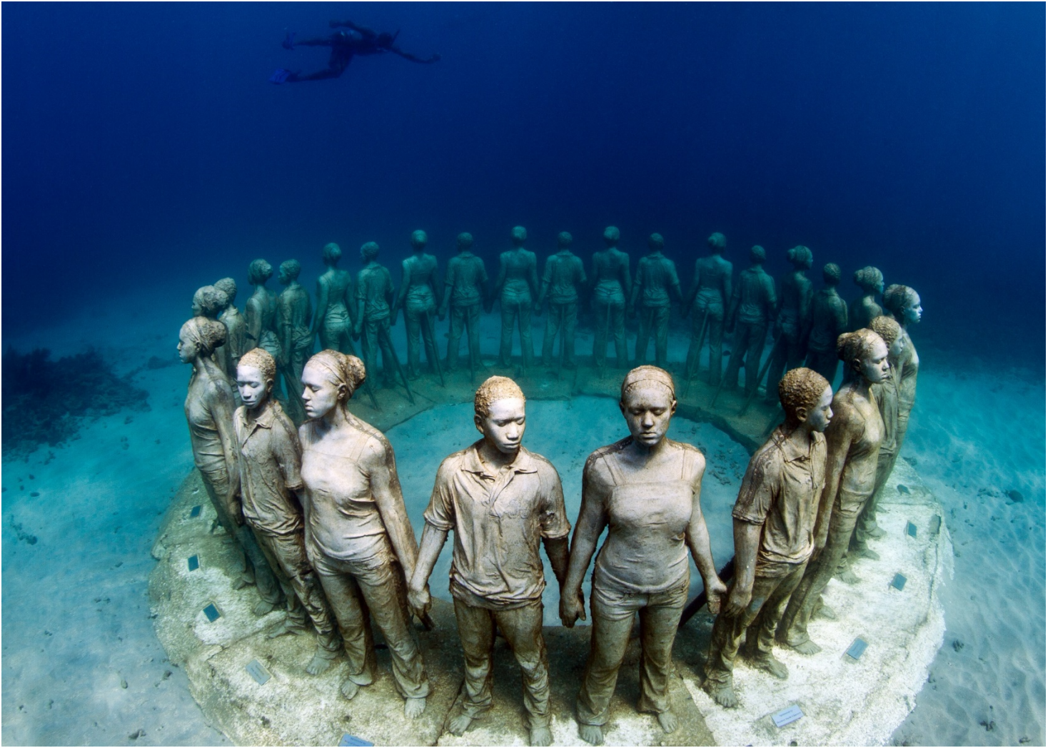
Plate 8: Jason deCaires Taylor, b. 1974, United Kingdom