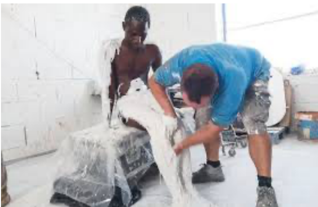
Plate 9: Jason deCaires Taylor

Site specific work made from cast pH neutral cement that enables ecological processes, situated 5 meters below the surface off the coast of Grenada.