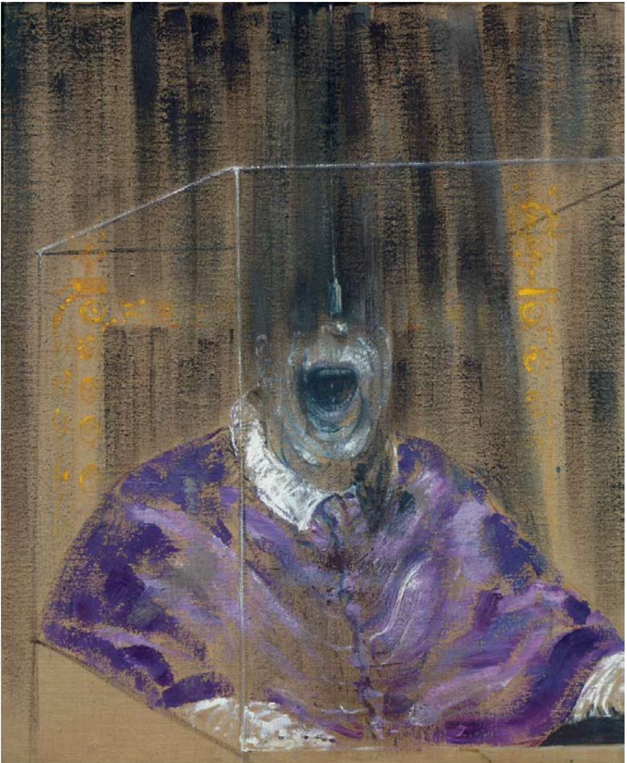
Francis Bacon Head VI 1949 Oil on canvas, 93.2 x 76.5 cm Arts Council Collection, Southbank Centre, London © Estate of Francis Bacon. All Rights Reserved, DACS 2008