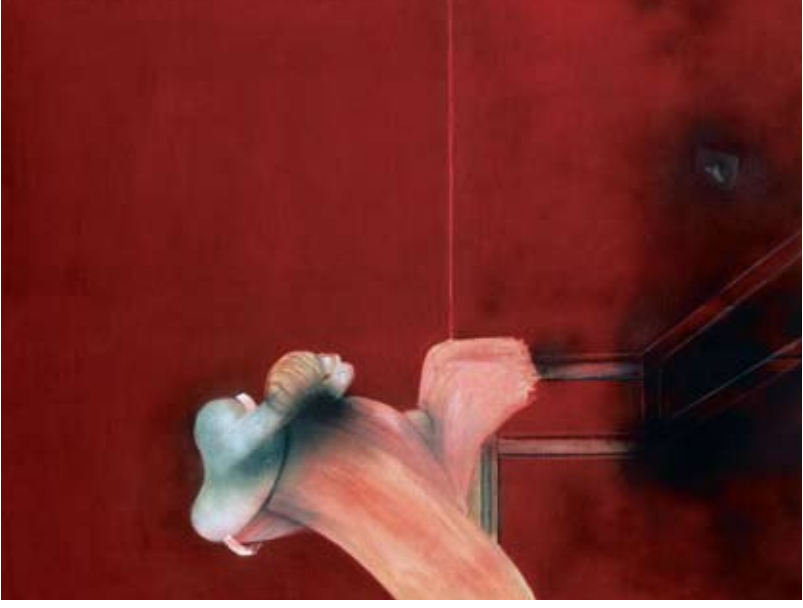
Francis Bacon Second Version of Triptych 1944 1988 Tate Collection