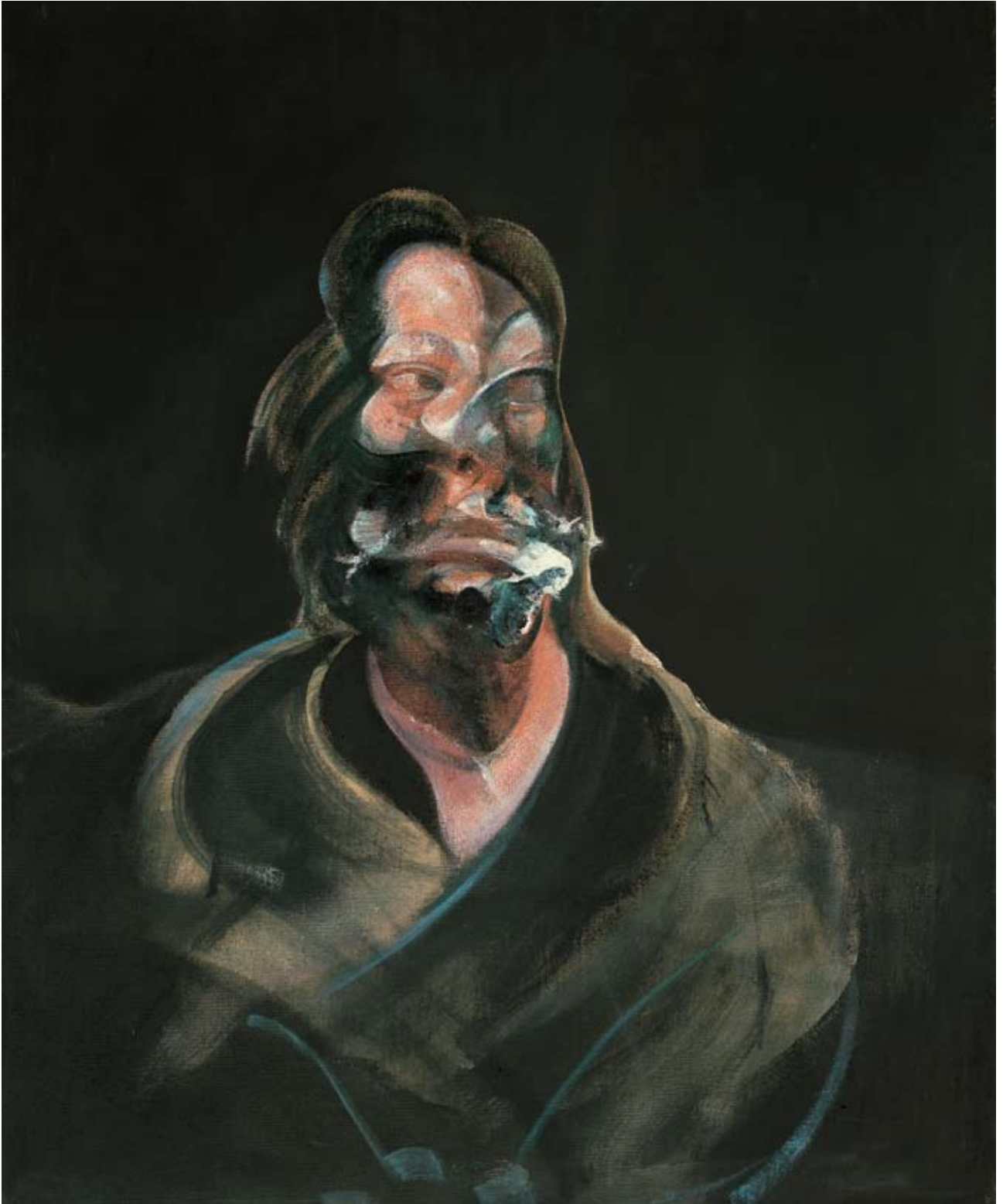
Francis Bacon Portrait of Isabel Rawsthorne 1966 Tate Collection © Estate of Francis Bacon. All Rights Reserved, DACS 2007